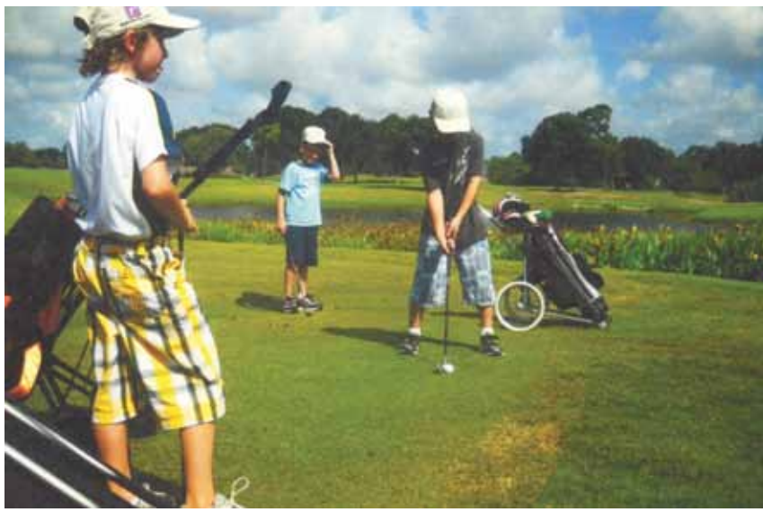
The 1st Tee Program at Chi Chi's Golf Club helps school youngsters embrace the nine core values of character and good citizenship.

Partnership Opportunities are available all year.