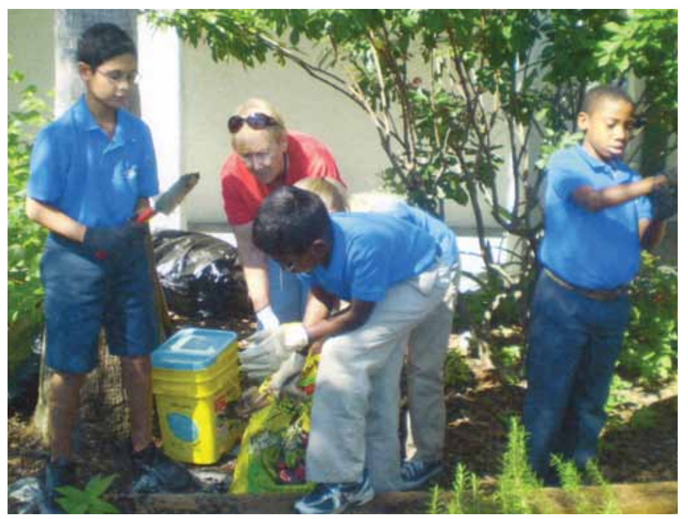
The Chi Chi Rodriquez School is also a member of the Audubon Cooperative Sanctuary Program. Here students help create a sustainable butterfly garden on campus.

each class, they have planted vegetables, woody plants and made a rain barrel to capture rainwater for irrigation. They also helped us attain Audubon re-certification by assisting in creating a sustainable butterfly garden for the school courtyard areas