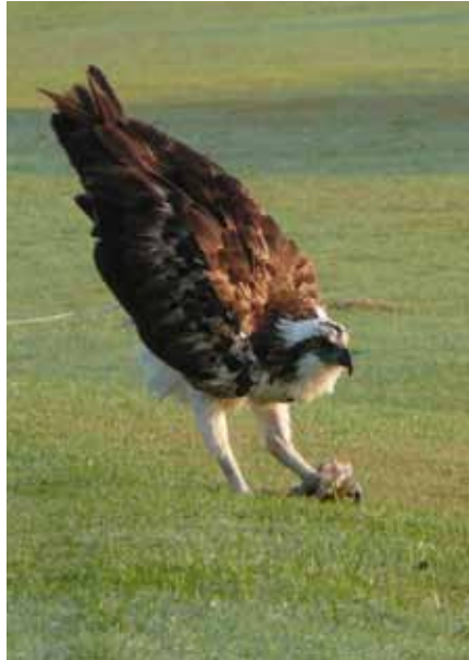
Estero C.C. is teeming with wildlife.

Constant and consistent communication over the years has given many members a better understanding of course-management efforts, and particularly the constant need to reduce maintained turf acreage by creating more natural areas. We use our club newsletter to educate members about water restrictions and the effect this will