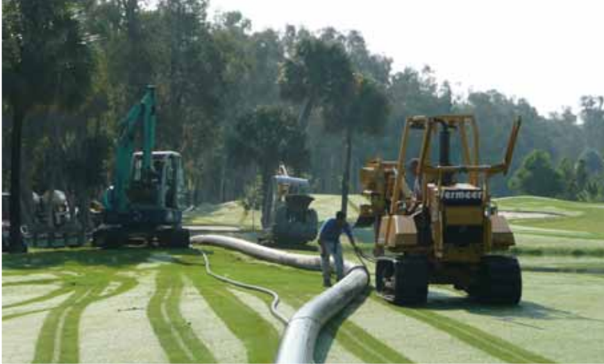
Recent Estero irrigation upgrades improved turf quality and helped reduce costs.

Estero established buffers by raising the height of cut along all lake banks from 1.25 to 6 inches.