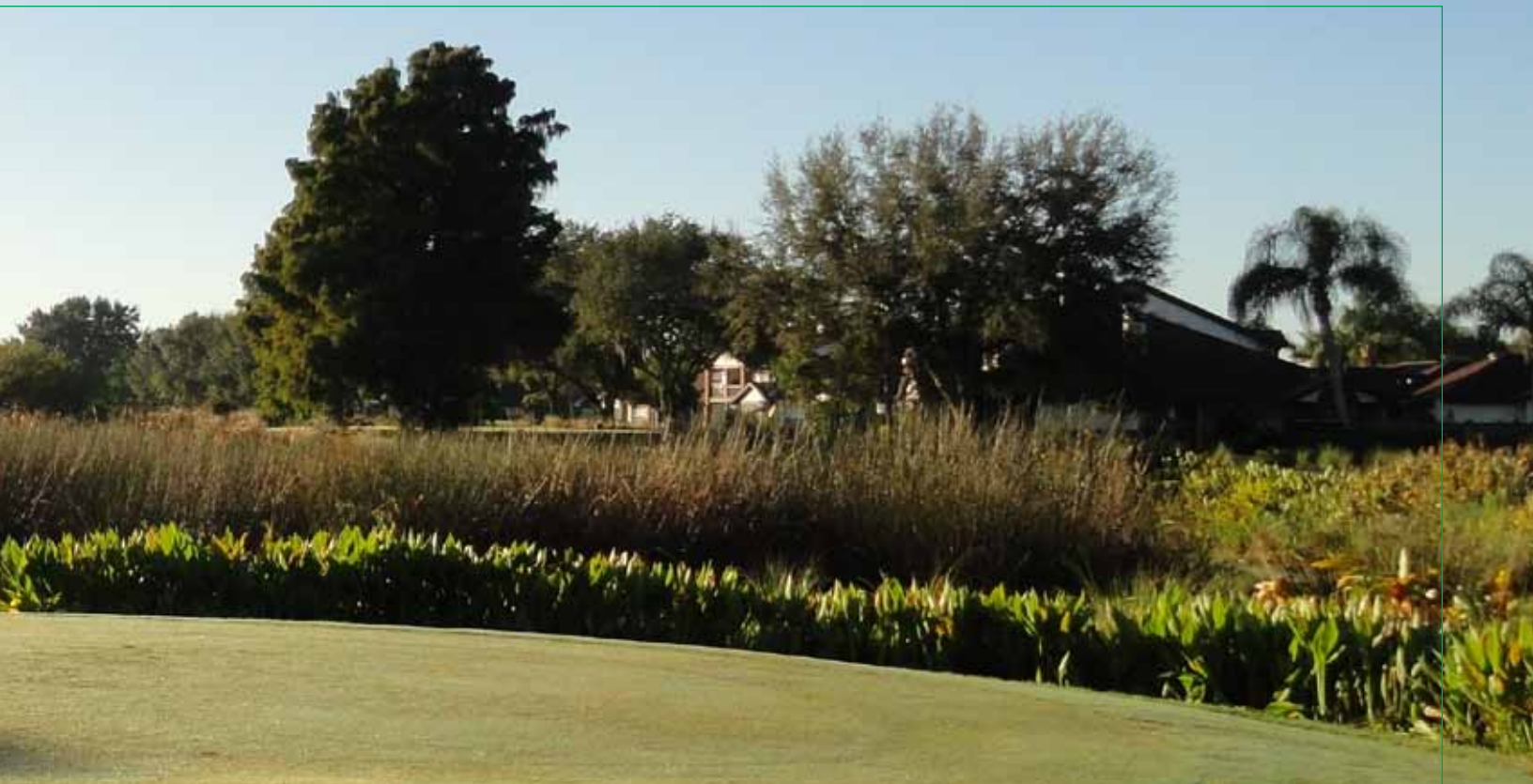
Estero Country Club is the 100th Florida Course Certified in the ACSP Program.

early in the morning when no golfers are in sight.