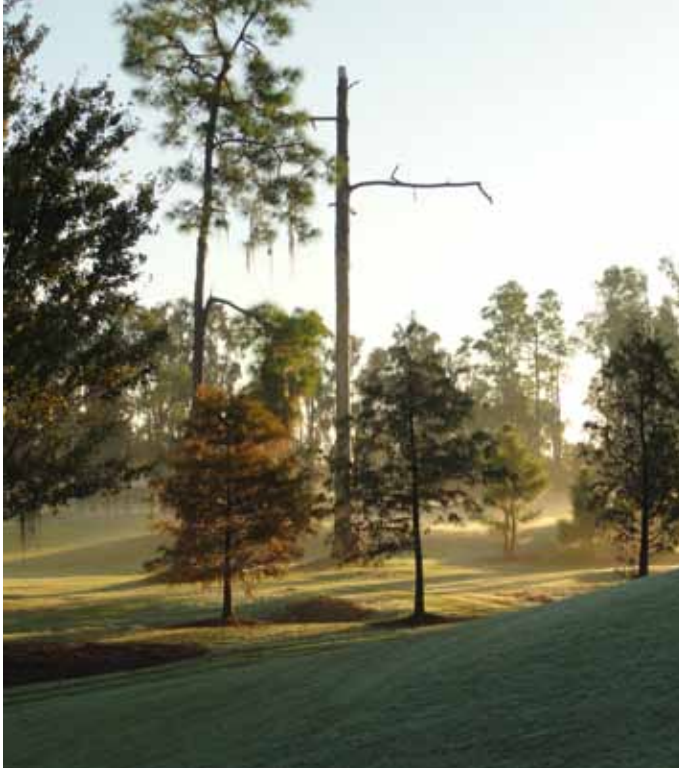
The Estero Country Club serves as an urban nature preserve.

of Olde Florida Golf Club, and of golf courses in general.