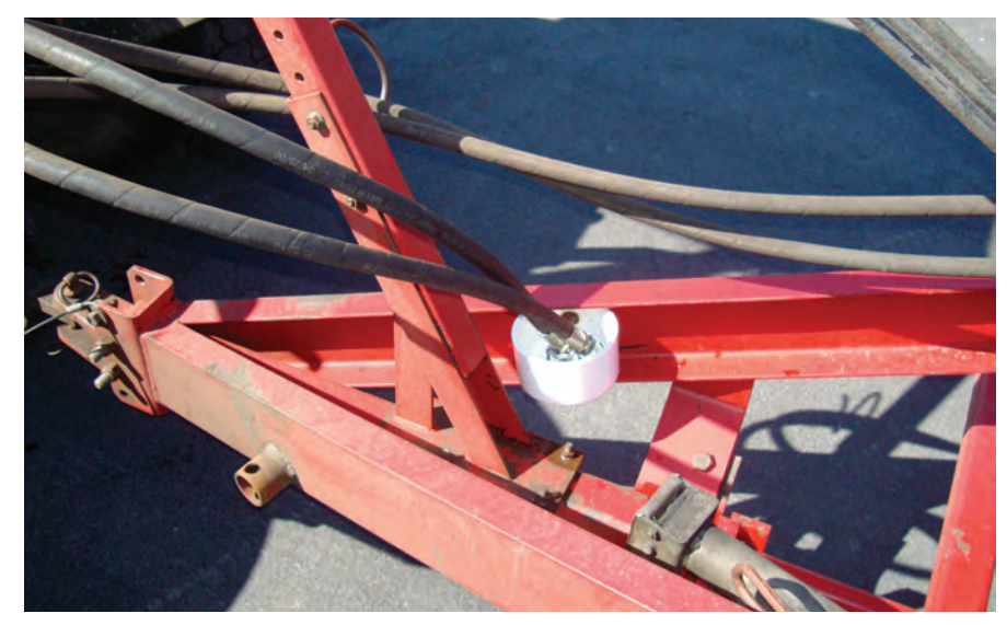
Placing disconnected hydraulic hoses in this handy hose cup prevents spills and slip hazards.

The resulting oil spill presents a potential slip-and-fall safety hazard.