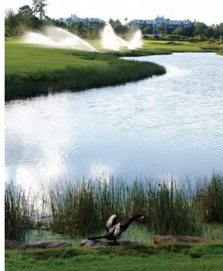
Part circle heads and aquatic plantings help protect the golf course waterways providing an environment where wildlife can thrive