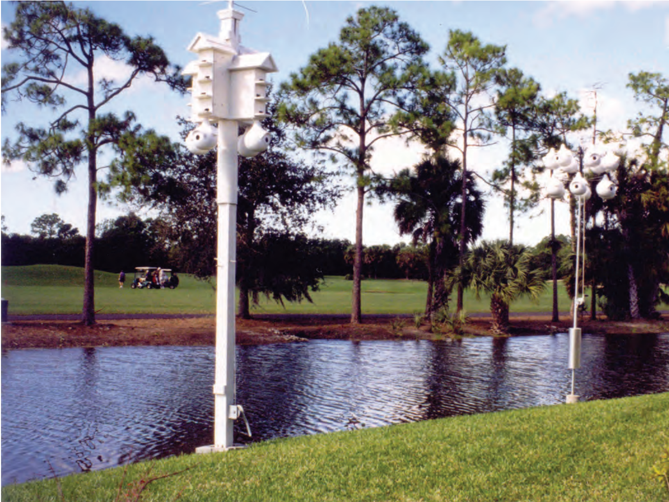
The ideal location of purple martin apartment houses is near water, close to a house or building and more than 40 feet from tall trees.

death by an owl's talon or crow's beak comes through the entrance hole. They want to nest as far back from the hole as possible. Typical apartment units are 6"x6"x6", which is effective but small. By removing the back panel of back to back units the depth can be increased. Given the opportunity, martins always choose the deeper units.