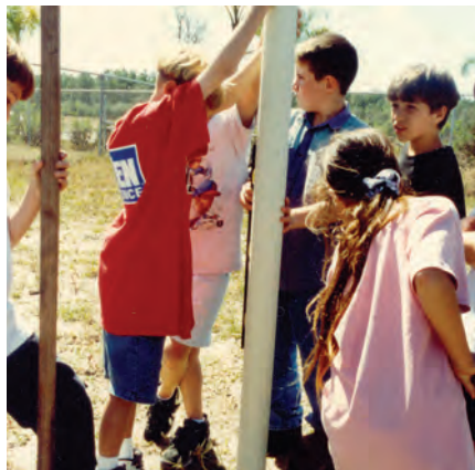
School children can learn a lot about purple martins and environmental stewardship on golf course by helping to install and monitor colonies on golf courses.

colonies going, it should be possible, for a period of six or so weeks, to have four or five students weekly lower the apartments and take egg and young data. In the classroom, students can present their data and follow and compare each colony for the study period. Mathematical skills can be practiced by determining means, modes and averages for each colony and the entire golf course. Also there would be an opportunity for students to relate field observations of martin behavior (and golf course stewardship) to the rest of the class.