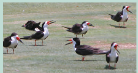
A large flock of skimmers resting on a fairway.