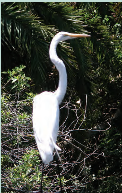
This great white heron is one of many shorebirds at Pasadena.