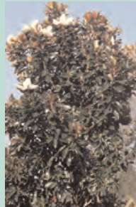
Little Gem Magnolia