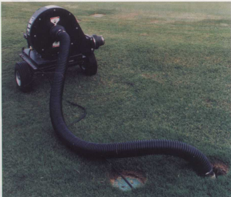
Quail West has several portable air handlers like this one that can be hooked up to each green's drainage system to move air through the root zone.

Quail West the quality they wanted, we needed to define who we are, why we're here, what are our objectives, and who is responsible for what. The process would pull people together as we answered those questions," he said.