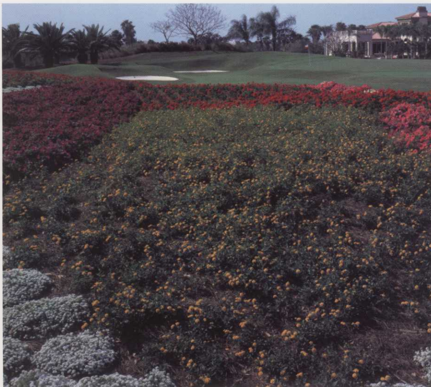
Close-up of the annual bed on No. 6 on the Lakes Course, a 215-yard par 3.

The Quail West courses share soil pH management challenges with many other courses in Collier County since the limestone bedrock is near the surface, and the irrigation water also tends to be