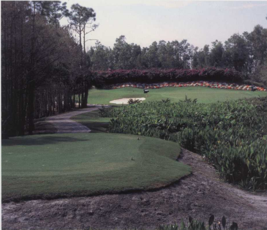
Many holes on the Preserve Course wind through dense woods. Note the fans on the 190-yard, par-3, seventh hole that help provide extra air circulation.