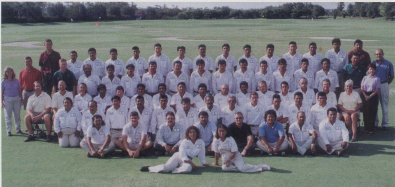
Quail West Maintenance Staff.