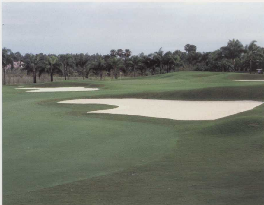
The Lakes Course ninth hole from the 150-yard marker on this 582-yard par five.

alkaline. With readings averaging around 7.8, Riger says elemental sulfur is applied annually in a late spring or early summer fertilizer application, and a