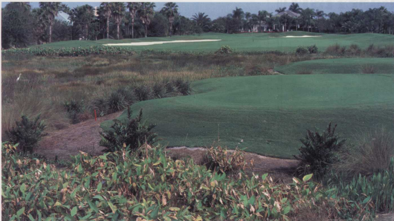
View from the tee of the par-4, 401-yard first hole on the Lakes Course. There are 50 acres of created, restored or preserved wetlands on the 36-hole layout.