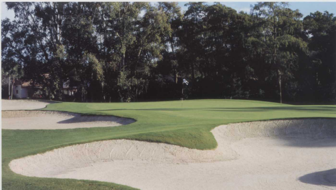
The green on No. 7 East guarded by three of the 110 bunkers on the course.