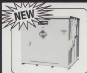
Complete self-contained chemical buildings

• Wash Rack Systems • Chemical Buildings • Spill Containment Products