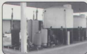
Wash Rack Systems – closed loop • sewer discharge