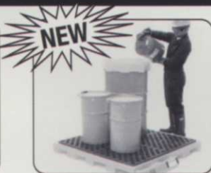
Spill containment products for shop of chemical rooms