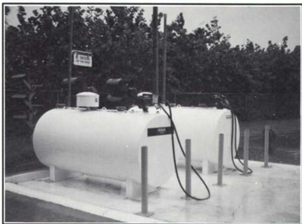
Orchid Island G.C