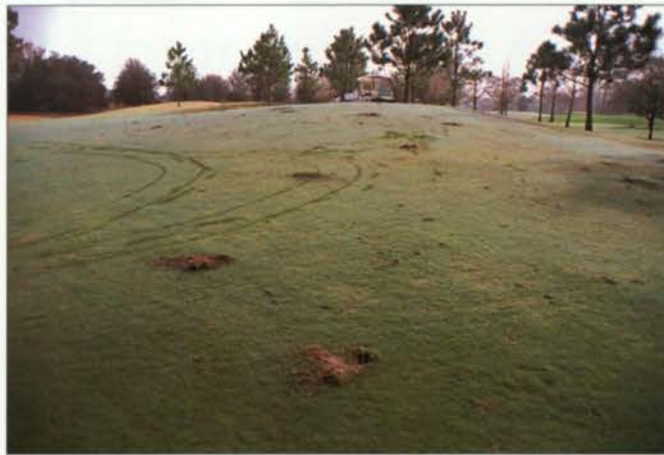
Insect control programs are necessary so that the turf on the left doesn't get to look like the area on the right (mole cricket and armadillo damage).