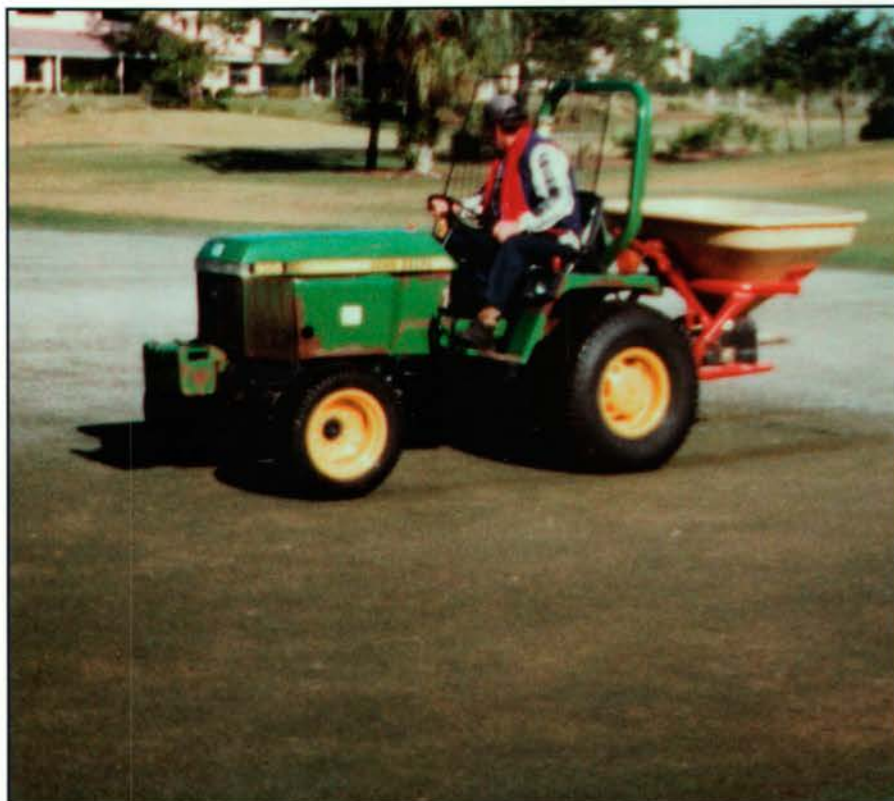
The Forest Country Club uses a Viccon spreader to accomplish their top dressing program.

In the meantime, here are some current insect control strategies that some of our peers are using. Matt Taylor of Collier's Reserve sent an excellent IPM-based article and seven more superintendents participated in a fact-sharing questionnaire.