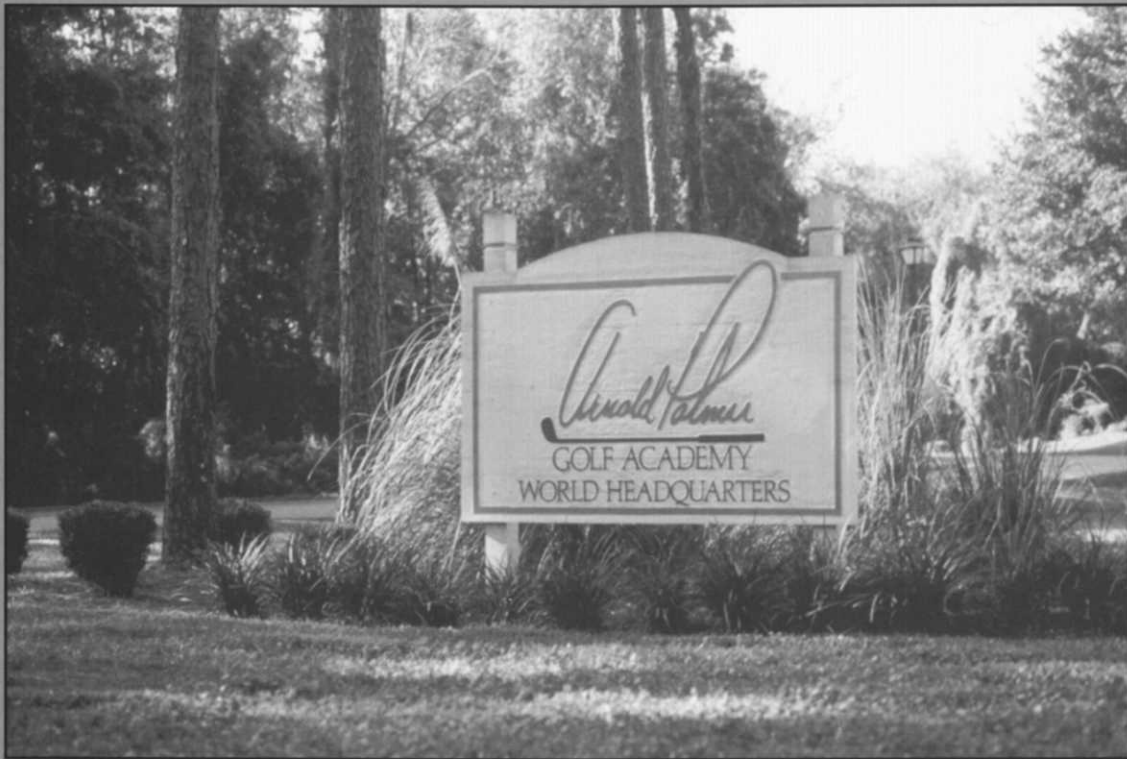
The Saddlebrook Resort is the world headquarters for the Arnold Palmer Golf Academy.