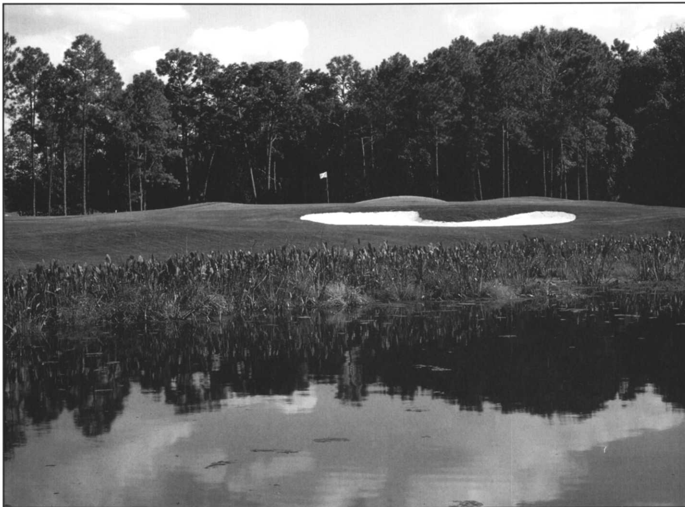
Palmer Course. Aquatic plants border the water hazard on the 9th hole.