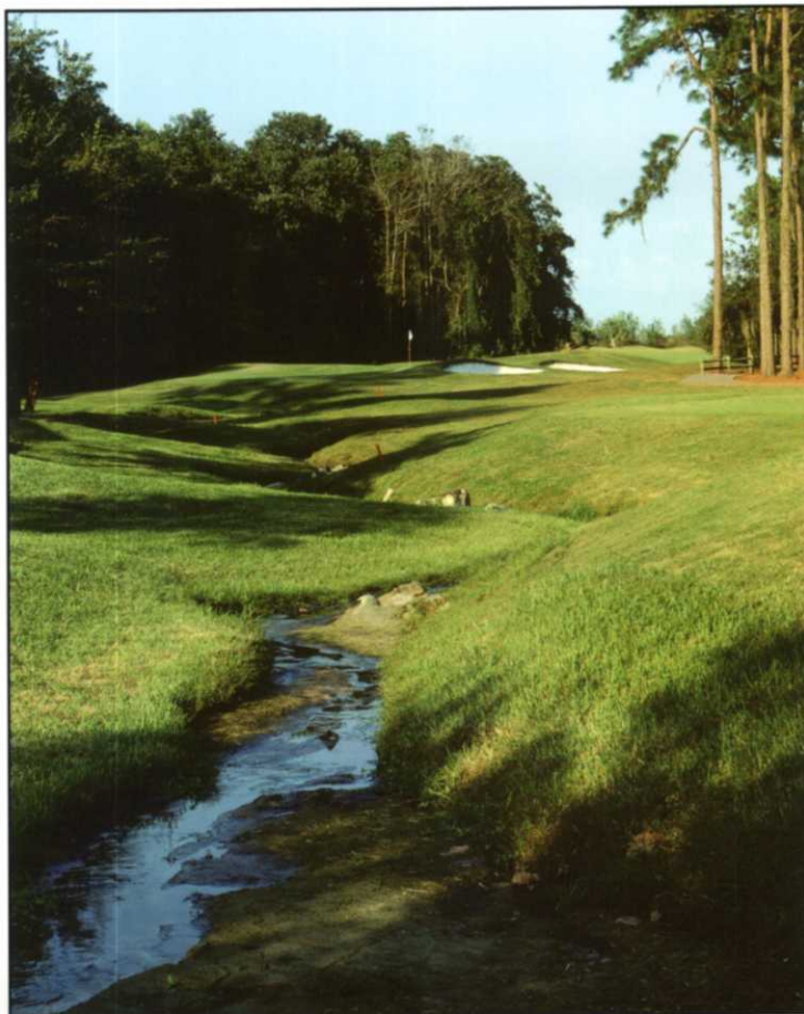
Palmer Course. A creek meanders along the 7th hole.

Hobbies and Interests - Golf when possible. Going to the beach. Not much free time lately!