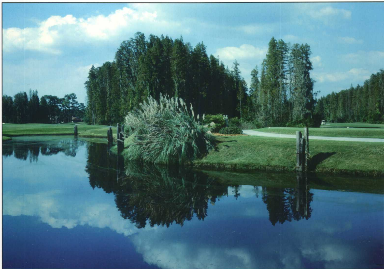
Saddlebrook Course. Pampas grass and pilings accent the first tee.