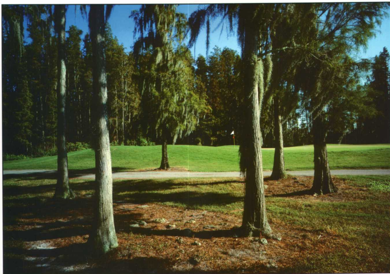
Saddlebrook Course. Cypress trees flank the 8th green.