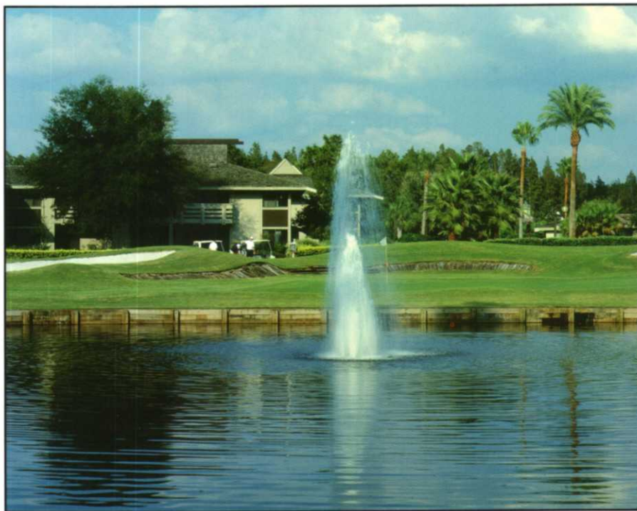
Saddlebrook Course. The 18th green sports a fountain and a unique application of railroad ties.