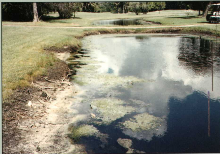
Canal at the Hole in the Wall Club before restoration project.