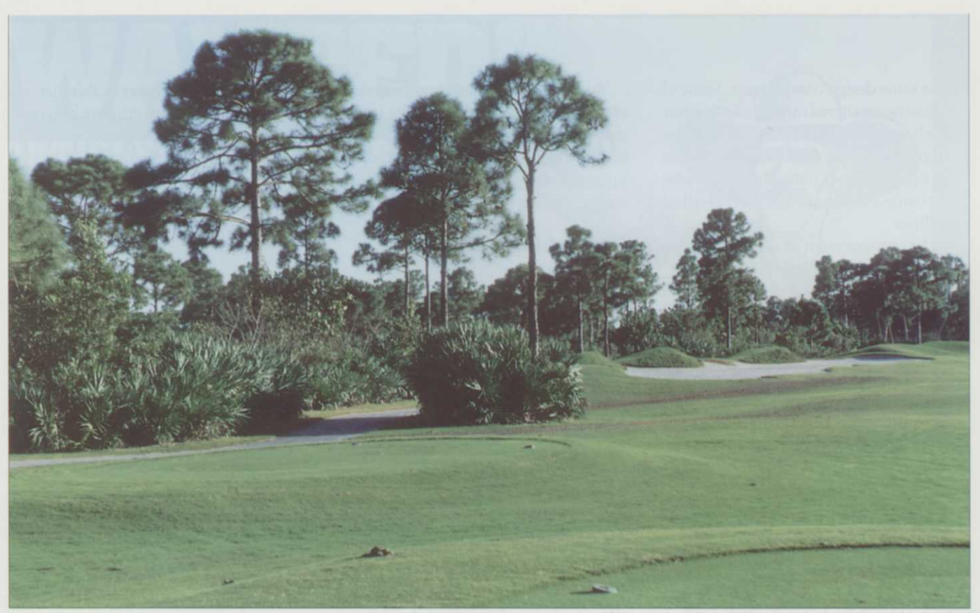
Homes, a shopping center, or even a landfill or a phosphate mine could lurk undetected behind the native vegetation, which makes a very effective buffer.