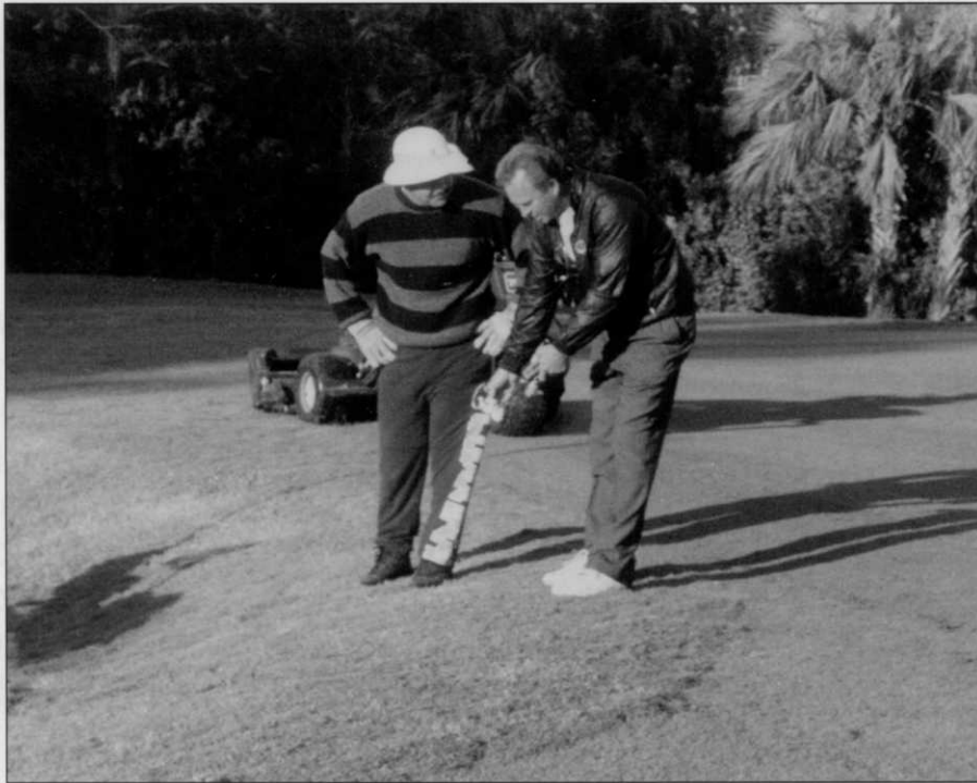
This superintendent developed a system of rating each employee for each task, each and every day.

This superintendent developed a system of rating each employee for each task, each and every day. Using a 10-