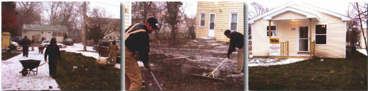
Members of the MAGCS Class C Committee makes a difference by sodding a Habitat for Humanity home in Aurora. The group will finish landscaping this home in Spring.

As the weather breaks the Class C Committee and others will meet again and finish up the project. If you would like to help, please feel free to contact me or the MAGCS office. -OC