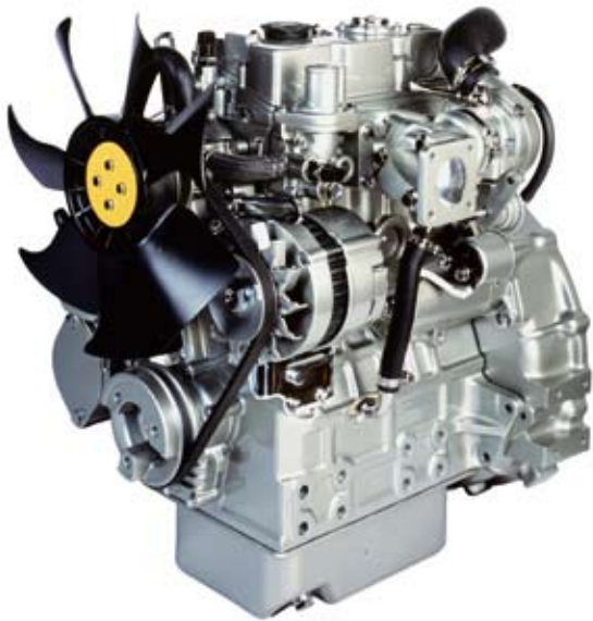
The latest 400 series of compact engines from Perkins have benefited from a number of improvements that make them both quieter and smoother running than existing designs