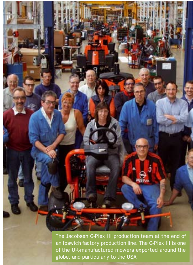
The Jacobsen G-Plex III production team at the end of an Ipswich factory production line. The G-Plex III is one of the UK-manufactured mowers exported around the globe, and particularly to the USA