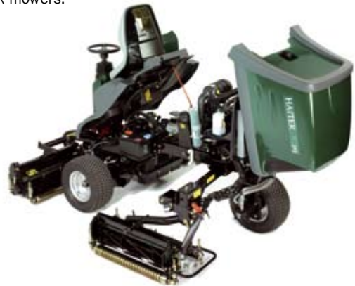
MT313 Tees & Surrounds Mowers: Light and agile, the MT313 Tees and Surrounds mower is one of Hayter’s best kept secrets.

The resultant rotary mower soon attracted interest from all that saw it, the net result leading to Mr Hayter giving up building houses and concentrating on mower manufacture. Over 60 years later, the company has evolved into a leading producer of both domestic and professional mowers from its plant in Spellbrook, Hertfordshire. Indeed, the Hayter name has often been used generically to describe assorted grass toppers and bank mowers.