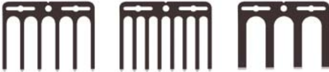
Allied Tine Combs

Further developments on the shop floor gave Allied a CNC Laser Profile Machine which is perfect for quick turnaround of flat blade type products in any shape or form. It was this facility that led to the innovative product – The Tine Comb (Patent Pending). This basically does away with the accepted design of a tine holder and singular tines.