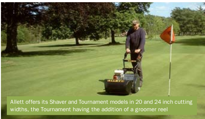
Allett offers its Shaver and Tournament models in 20 and 24 inch cutting widths, the Tournament having the addition of a groomer reel