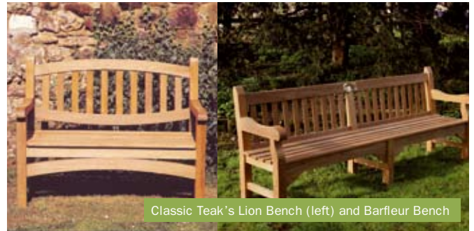
Classic Teak's Lion Bench (left) and Barfleure Bench

In today's market quality is often vying for position, the outdoor furniture industry being rife with inferior products imported from across the globe. The simple equation is quality versus cost versus value; the misconception is often that value and cost are the same thing, which of course they are not. Classic Teak's customer base spans the entire range from schools, landscapers, parks and gardens to major hotel chains and the Sandringham Estate.