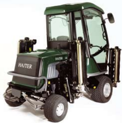
T424 Turf Mower: It is commercial users who tend to favour models such as the T424. Although a cab adds weight, it helps keep operators happy in all weathers