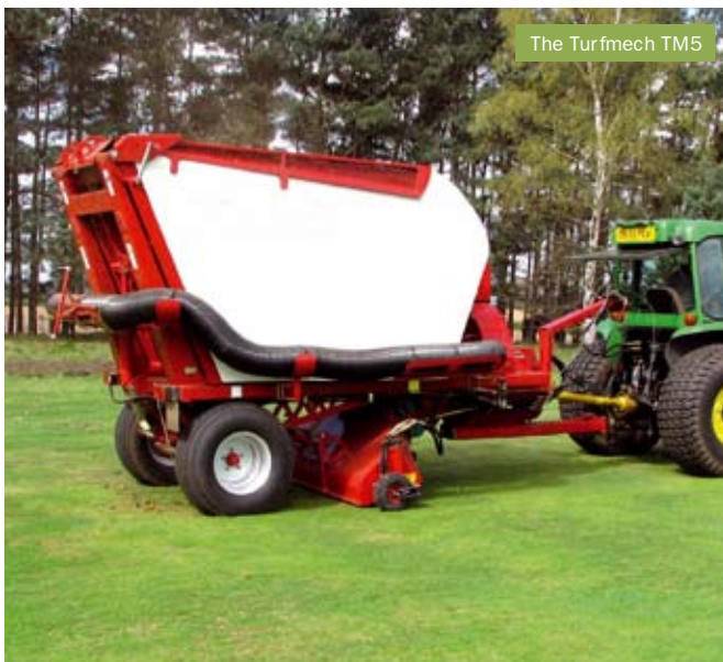
The Turfmech TM5

Although remaining a relatively small company, employing around 30 staff at its Hixon, Staffordshire base, Turfmech is a strong advocate of British engineering skills, supporting graduate training and promoting further education for numerous past, present and future employees.