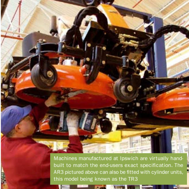
Machines manufactured at Ipswich are virtually hand-built to match the end-users exact specification. The AR3 pictured above can also be fitted with cylinder units, this model being known as the TR3

1832 being made under licence from inventor Edwin Budding. Protected by a patent filed in 1830, the JR & A Ransomes manufactured mowers were initially sold for domestic use and signalled the beginning of lawnmower production in the UK.