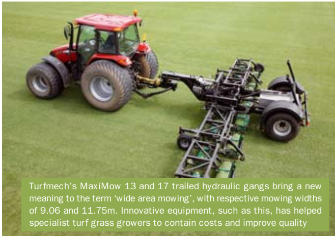
Turfmech's MaxiMow 13 and 17 trailed hydraulic gangs bring a new meaning to the term 'wide area mowing', with respective mowing widths of 9.06 and 11.75m. Innovative equipment, such as this, has helped specialist turf grass growers to contain costs and improve quality

producer in its own right, manufacturing, marketing and supporting a product range specified and used by turf growers, groundsmen, course managers, greenkeepers, contractors and turf and grounds maintenance professionals throughout the British Isles and overseas.