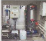
The ENZYMATIC15 wash water recycler. Designed & built in the UK by ByWater