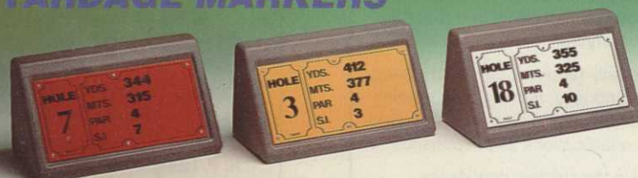
Double sided plinth, plus any colour yardage plate available - P.O.A.

They're nice, they're neat, they're just £35 complete