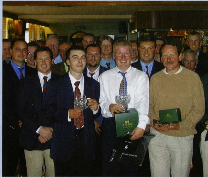
A thunder and lightning storm didn't dampen the spirits at the recent Northern Ireland Section meeting at Killeel Golf Club in County Down. Around 20 played golf but with holes running out a dramatic thunder storm struck and the sensible ones among the players high tailed it back to the clubhouse thus forfeiting any chance of a place in the prizes.