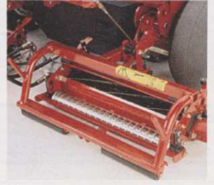
The new cutting system

Floating cutting units follow ground contours like never before, while the ability of the cutting units to steer prevents sliding and scuffing when turning. Liquid cooled and diesel powered, it is exceptionally quiet, gives minimal vibration, comfortable seating and single joystick fingertip controls.