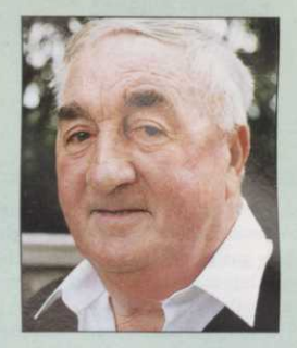
Head Greenkeeper for 18 years.

7. What would you do to improve the life of a greenkeeper? Pay more.