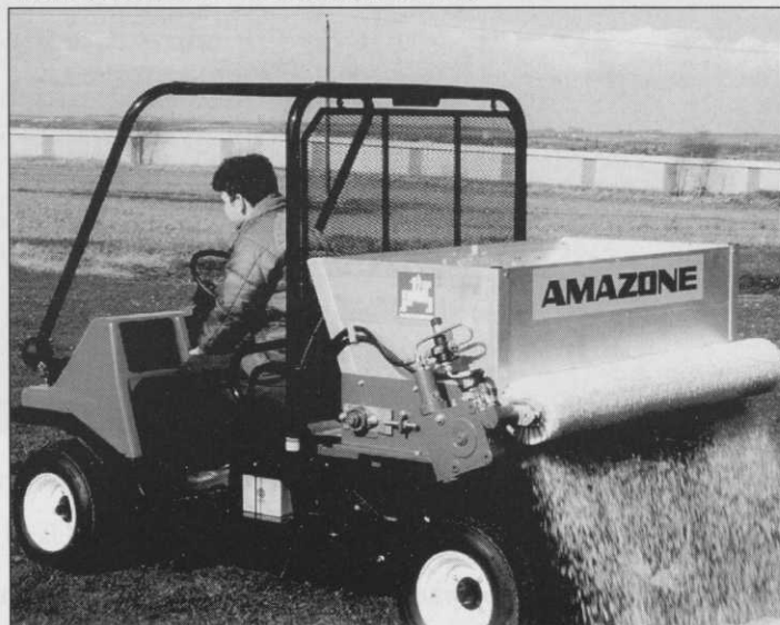
Amazone Ground Care - De-Mount spreader body

Capacity is 600 litres and the body comes complete with sup-