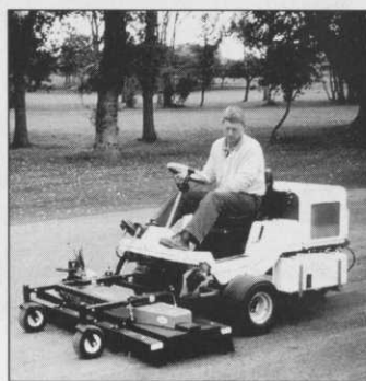
The Huxley Grainskeeper

Price is £3,550 and for further information Tel: 01953 605151.