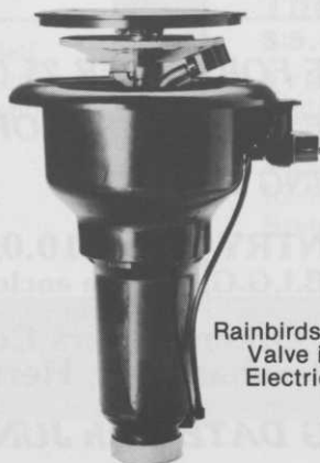
Rainbirds new 95DR Valve in Head Electric Rotor.

PES scrubber valves are effluent water valves which contain a self-cleaning flow activated scrubber consisting of a stainless steel cylinder screen and a plastic scraper. The scrubber keeps algae, micro-organisms or silt from clogging the valve control ports thus giving trouble free operation in very dirty waters.