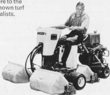
JACOBSEN Greens King 3 gang 70"