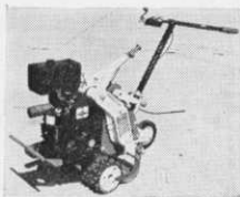
JACOBSEN Sod cutter 12" to 17"

The widest range of professional machines for local authorities, parks and sportsgrounds from Britain's most experienced distributors. Write or ring for the catalogue or a demonstration anytime anywhere to the country's best known turf machinery specialists.