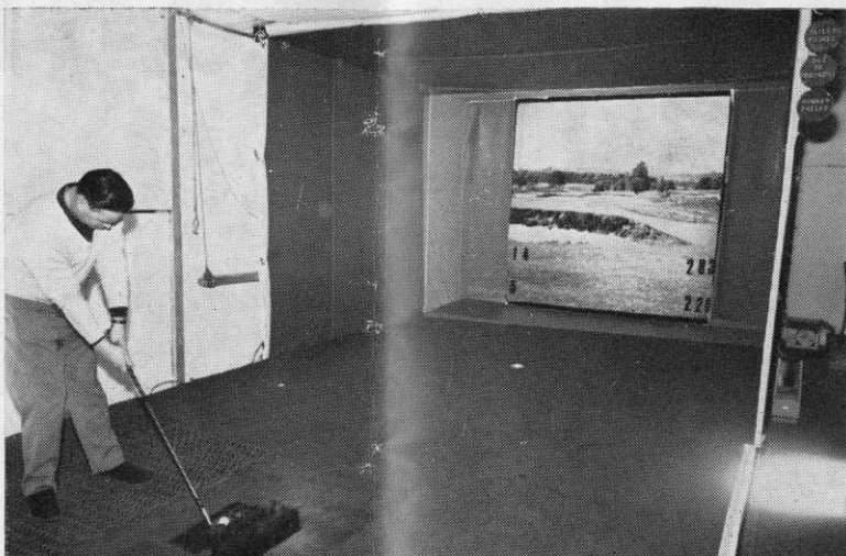
Photograph shows Golfer about to take second shot to green.

" This could be the type of advertisement that the manufacturers of "Vistagolf" Indoor Golf Equipment and their sole agents, Messrs T Parker & Sons (Turf Management) Ltd., would like to see frequently in this Journal during the next few months.