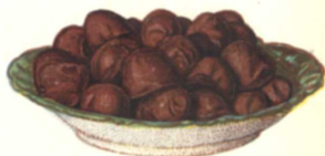
CHOCOLATE BUTTER CREAMS. (See Page 51.)