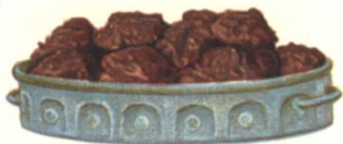
CHOCOLATE COCOANUT CAKES. (See Page 43.)