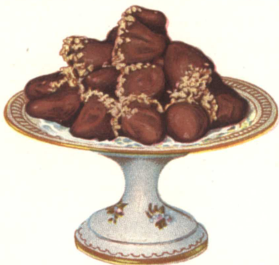
MAPLE FONDANT ACORNS. (See Page 48.)