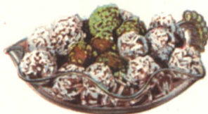
ALMOND FONDANT BALLS. (See Page 50.)