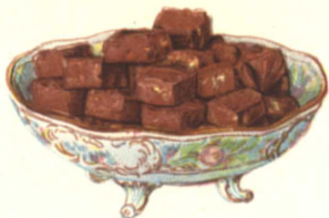
BAKER'S CHOCOLATE "DIVINITY." (See Page 44.)