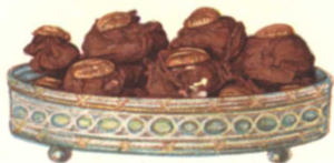
CHOCOLATE PECAN PRALINES. (See Page 40.)