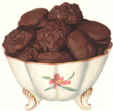
CHOCOLATE OYSTERETTES. (See Page 40.)