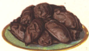
STUFFED DATES, CHOCOLATE DIPPED. (See Page 39.)