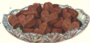
FUDGE HEARTS OR ROUNDS. (See Page 42.)