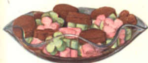
PEPPERMINTS, CHOCOLATE MINTS, ETC. (See Page 37.)