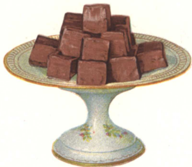
PLAIN CHOCOLATE CARAMELS. (See Page 45.)