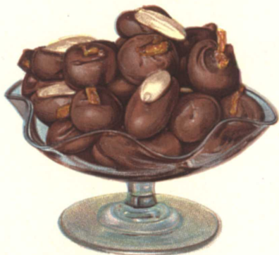
ALMOND AND CHERRY CHOCOLATE CREAMS (See Page 47.)