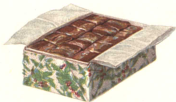
RIBBON CARAMELS. (See Page 45.)