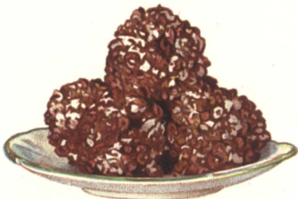
CHOCOLATE POP CORN BALLS. (See Page 53.)