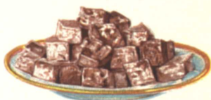
TURKISH PASTE WITH FRENCH FRUIT. (See Page 40.)