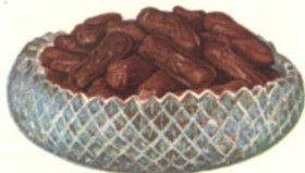
ALMOND FONDANT STICKS. (See Page 49.)