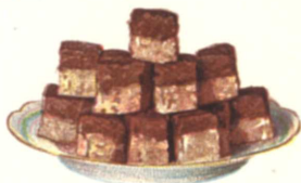
DOUBLE FUDGE. (See Page 41.)