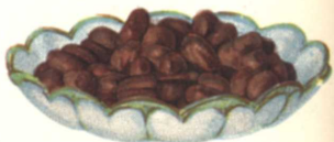
CHOCOLATE PEANUT CLUSTERS. (See Page 39.)