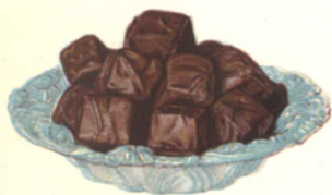
CHOCOLATE DIPPED FRUIT FUDGE. (See Page 43.)