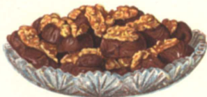
WALNUT CREAM CHOCOLATES (See Page 50.)