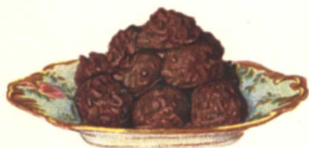
SURPRISE CHOCOLATE CREAMS. (See Page 52.)