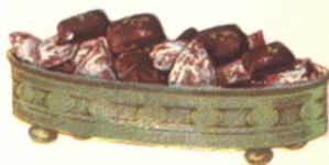
CHOCOLATE DIPPED PARISIAN SWEETS. (See Page 39.)