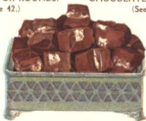
MARSHMALLOW FUDGE. (See Page 42.)