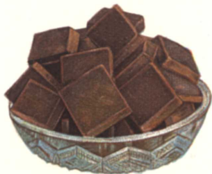
COCOA FUDGE. (See Page 29.)