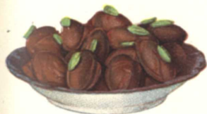
ROSE AND PISTACHIO CHOCOLATE CREAMS. (See Page 51.)