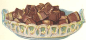
MARbled FUDGE. (See Page 42.)