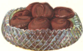
CHOCOLATE PEPPERMINTS. (See Page 47.)