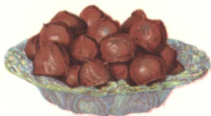
FIG AND NUT CHOCOLATES. (See Page 48.)