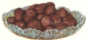
GINGER, CHERRY, APRICOT AND NUT CHOCOLATES. (See Page 38.)