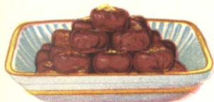
CHOCOLATE MARSHMALLOWS. (See Page 48.)