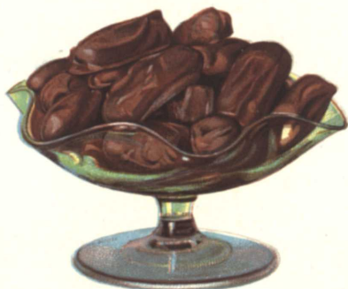
CHOCOLATE NOUGATINES. (See Page 44.)