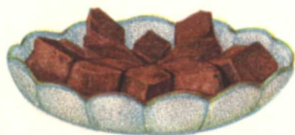
VASSAR FUDGE. (See Page 41.)