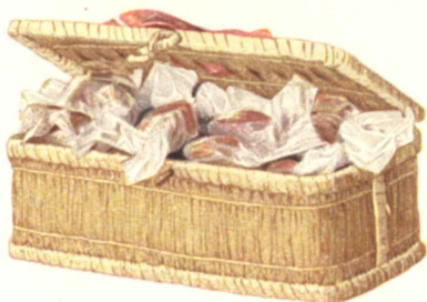
CHOCOLATE MOLASSES KISSES. (See Page 53.)