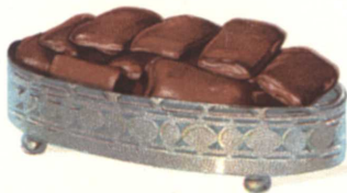
CHOCOLATE ALMOND BARS. (See Page 49.)