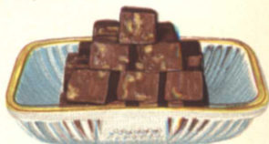
CHOCOLATE NUT CARAMELS. (See Page 45.)