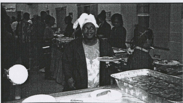
Delicious food served following the program