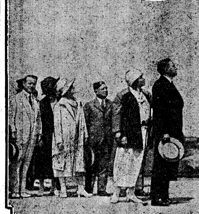
PRESIDENT COOLIDGE AT PLYMOUTH