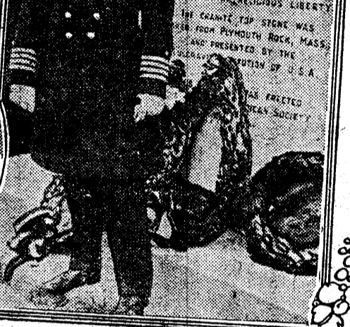
NEW ENGLAND MONUMENT (International)