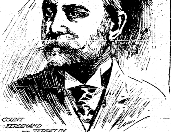
Count Ferdinand von Zeppelin, who has made the most successful aerial voyage ever achieved in a dirigible balloon, has spent many years studying the question of aerial navigation, and in his day has constructed many dirigible machines. Count von Zeppelin is 60 years of age.

NEW PRODUCTS OF FARM. Profitable Use for Much That Has Been Thought Valueless. While nearly every product of the farm can be used and is destined for special purposes, the farmer has not fully realized the value of many of his products. The use of manure as fertilizer is one of the most important.