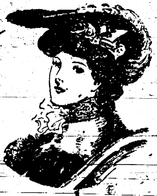
A dark brown plush hat with plumes and loops of cream color.