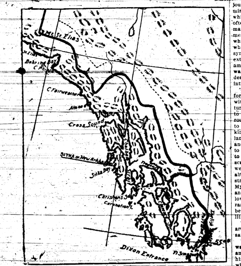
The dark line in the above map shows the boundary claimed by the United States. The line proposed by Canada runs much nearer the coast and leaves the headwaters of several inland Canadian territory.