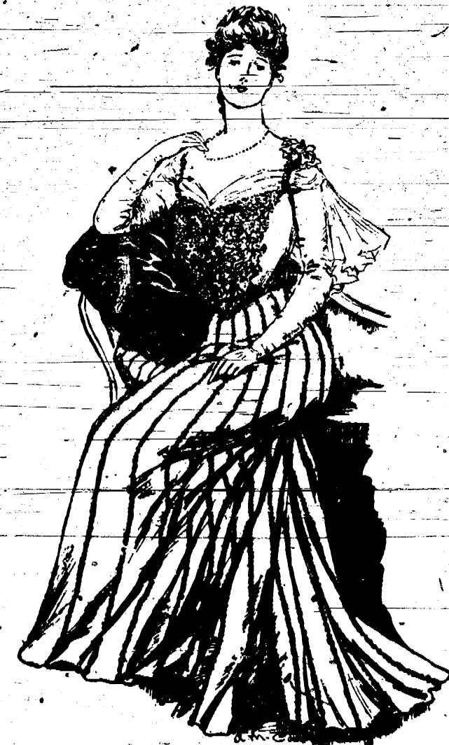
BEAUTIFUL OPERA GOWN.

This opera gown is of silver gray chiffon spangled in steel, with a plastron of steel on the bodice. The "fingering" sleeves are of gray tulle and