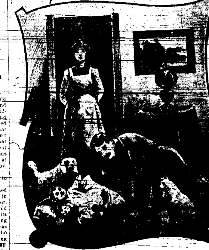
"Well, now, we'll have some fun and life around the house," said he, getting down on the floor to investigate the new plaything.

There was whisky enough and provisions enough, so that we did not fear dying of thirst and hunger, but we were pining for amusement. Forty days and forty nights shaking dice and playing poker at the Red Goose had become monotonous.