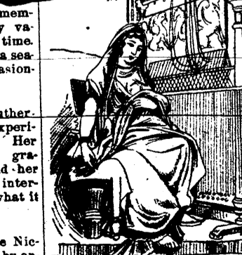
FENELope AT HER LOOM.

Although there are numerous private manufactory of tapestries and carpets at different parts of France, there is besides the Gobelins but one manufactory under the immediate direction of the Minister of Public Instruction and Fine Arts, which is that of Beauvais.