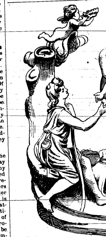
OLD SEVERE BISCUIT—THE JUDGMENT OF PARIS.

HAVE JUST SEEN a list of the packages that have been placed on exhibition at Chicago. They are twenty-one in number and the whole collection forms such a huge bulk that it has been chartered a special steamer to carry it across the Atlantic and the special trains retained for its transportation from the seaboard to Chicago.