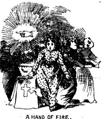
A HAND OF FIRE.