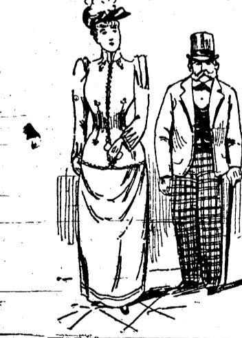
WHAT SHE TAKES.