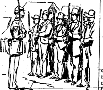
GROUP OF RECRUITS.

factory being at Springfield, Mass., and as a result the Confederates were not thoroughly equipped to meet the regular supplies from abroad. After that time they had the advantage on many battlefields, for they were equipped with new English rifles from the noted English armory.