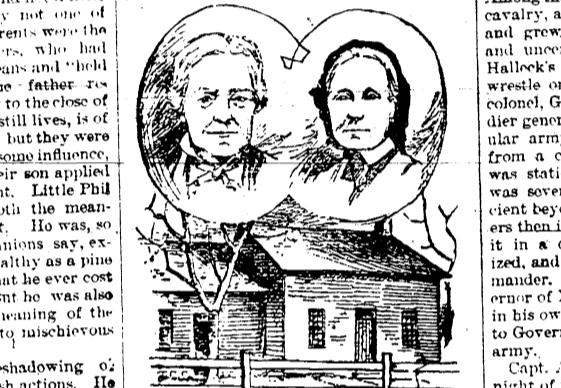
SHERIDAN'S HOME. The home of the great soldier in Washington, D.C., where he lived for many years.