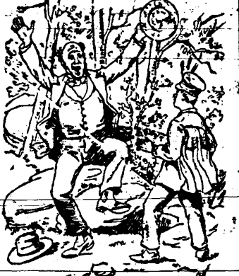
The Treasure of Franchard.