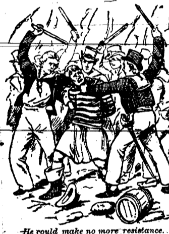
He would make no more resistance.

"I had no doubt, knowing the nature of the business, and the haste made after a run to get the cargo safely stowed away and disposed of, that Joshua intended to take it in two loads, probably on the morning of the 23rd."