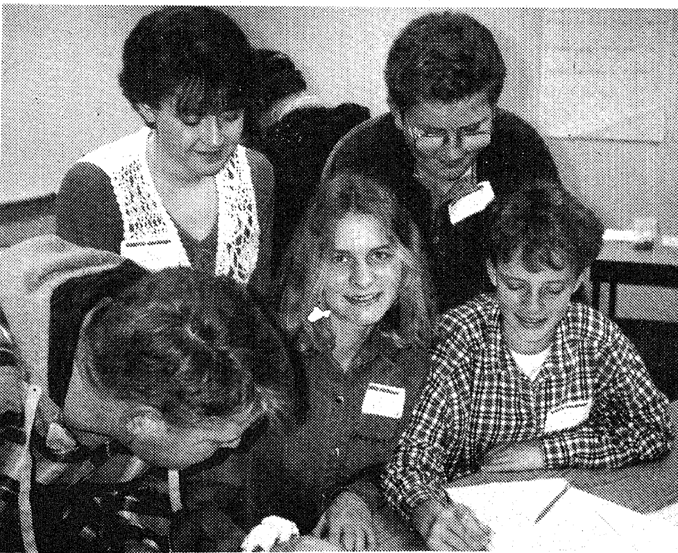
At left, Laker Junior High Eighth Graders.

chemicals and their uses by our society. four industries were discussed - computers, food processing, chemical manufacturing, and oil refining. these industries were examined as a basis for discussions and their impact on the business community.