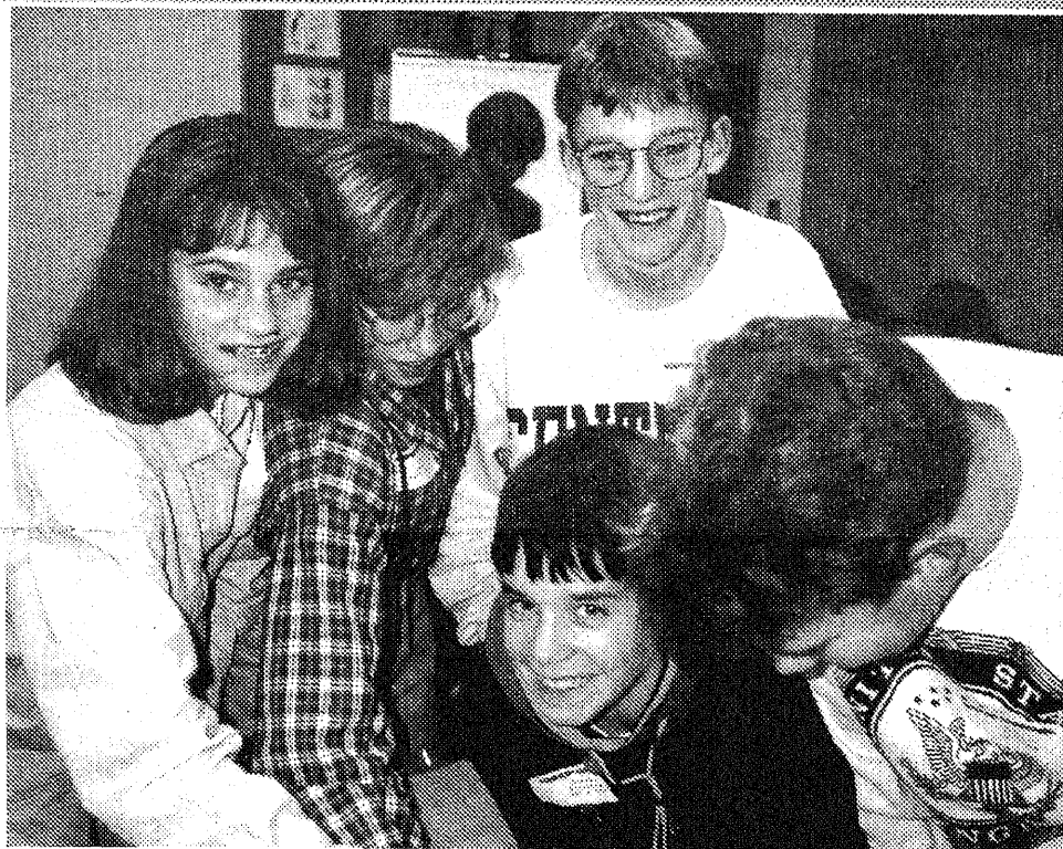
Above, Laker Junior High Seventh Graders.

The CEPUP Challenge featured the module, "Island Factory". The students were lead through a series of hands-on activities, where they explored chemical and other math and science concepts and processes. CEPUP highlights