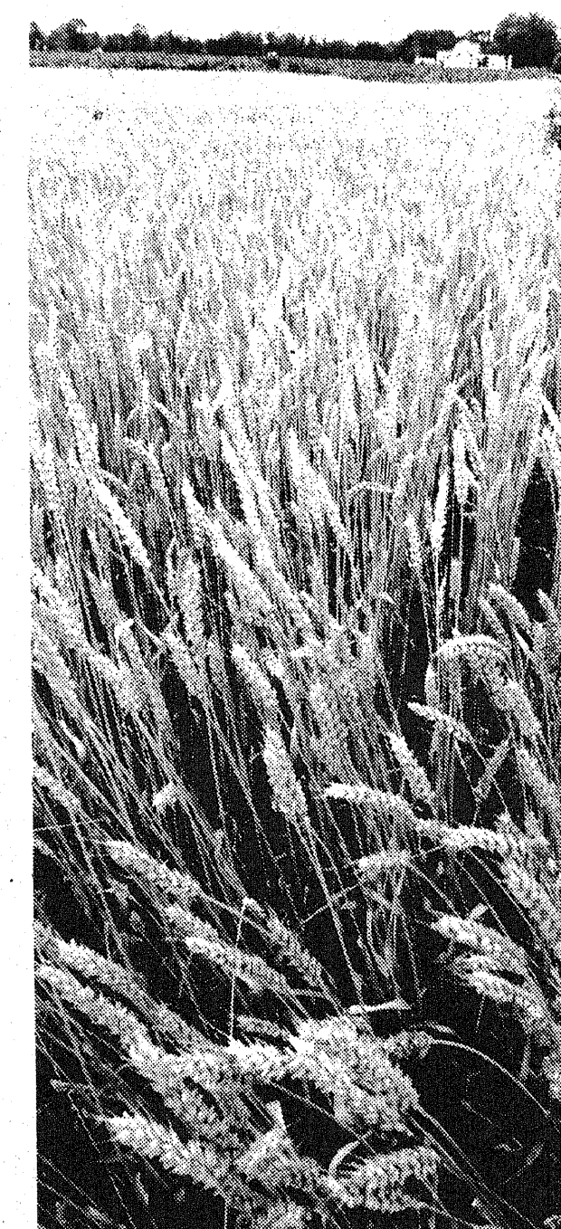
EVERYTHING stands ready for this season's wheat harvest to begin.