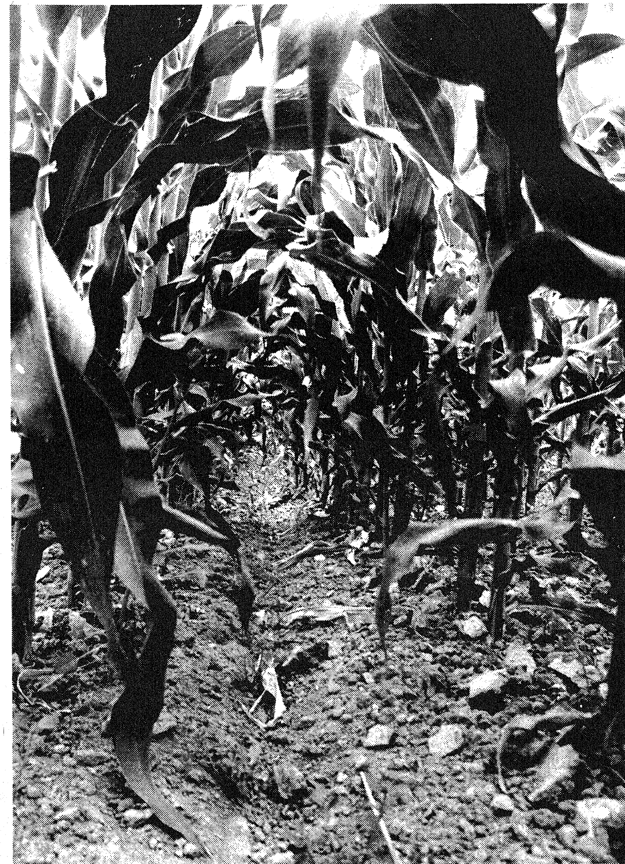
THE VIEW THROUGH a tunnel of corn stalks and leaves shows healthy young plants. With corn about to tassel, an inch or 2 of rain would help insure a good crop.