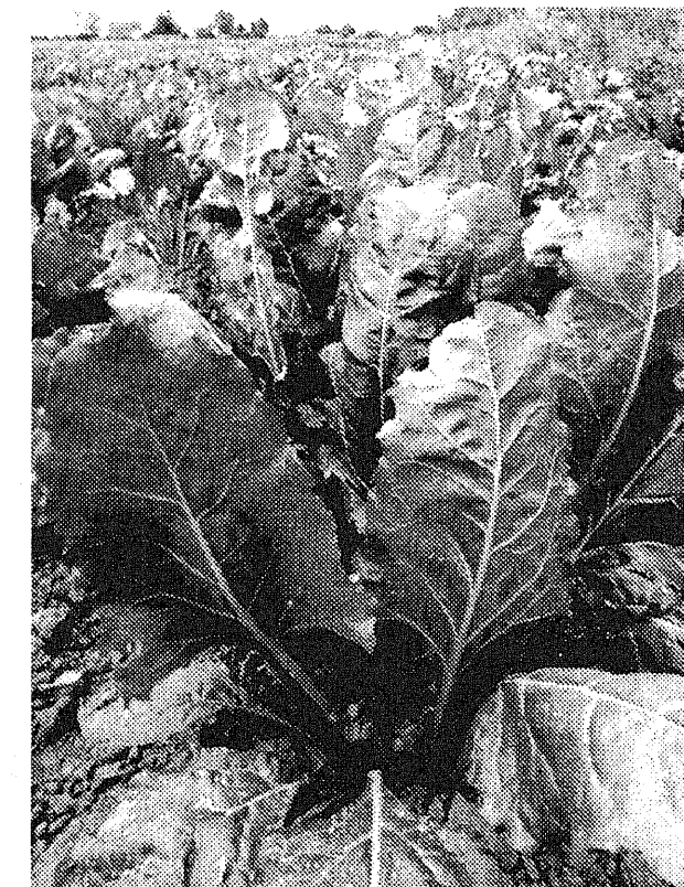
IT TAKES MILLIONS of beet plants to make tons of sugar, and this year's crop looks good so far.

Man first broke the ground and planted seeds thousands of years ago, but still today modern farmers watch for rain and luck.