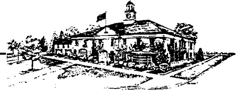
Marshall Town Hall ca: 1857

323 W. Michigan Avenue • Marshall, Michigan 49068