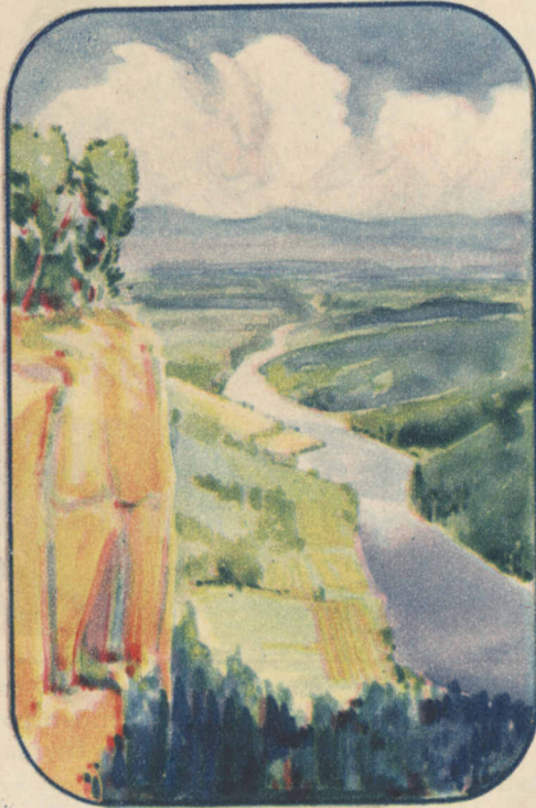
Beautiful Meandering Tennessee River.

Trains Leave Chicago, Dearborn Station (Polk and Dearborn Streets) via C & E I Ry.