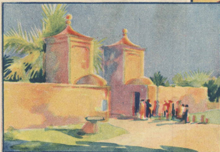
Gates to St. Augustine, Fla., Completed in 1804.