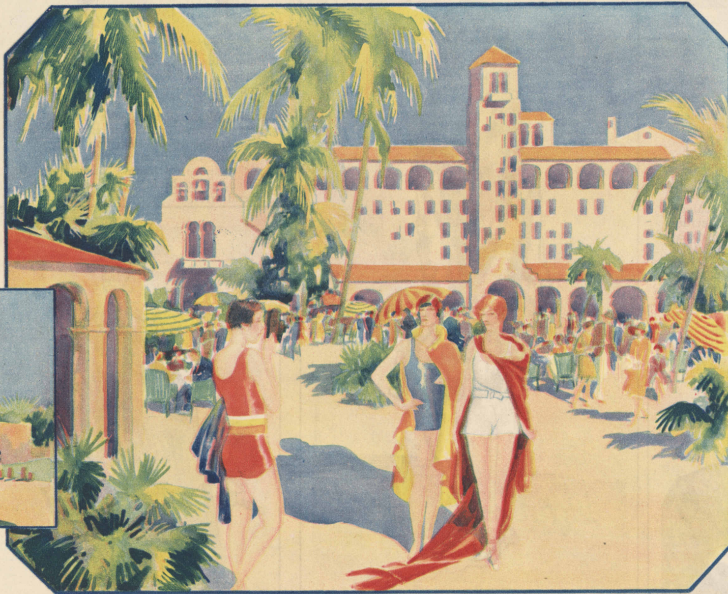
Florida—Where Northern Sun-Hunters Rest, Relax and Play.