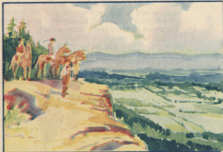
Moccasin Bend from Lookout Mountain, Chattanooga, Tenn.

Tuesday, January 1st, at 10:30 p. m., the all-new, all-steel "Dixie Flyer" will leave Chicago on its initial trip to Florida via the scenic, historic Dixie Flyer Route, carrying through sleeping cars to Palm Beach, Miami, Tampa, Sarasota and St. Petersburg. An innovation in modern passenger car service will be the smart Club-Lounge car of this luxurious train. Located midway in the train, this unique arrangement eliminates your having to "walk a mile" for a chance to read, chat or observe the scenery en route. Roomy movable chairs and movable tables offer an opportunity to form your own little group or to enjoy seclusion—as you wish. Added to this new Club-Lounge car, used only on the "Dixie Flyer," will be the regular Observation-sleeping car, eight section Drawing Room Compartment sleeping cars and Drawing Room open section sleeping cars with permanent head boards—the latter offering privacy at all times. Dining Car for all meals. Coach service is included. Florida-bound passengers who use the new "Dixie Flyer" are assured the convenience of their favorite club, the luxury of their own home, combined with the service of a great hostelry.