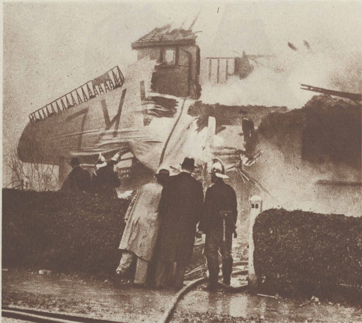
WHERE 14 DIED IN A FLYING FURNACE—Burning wreckage of a Dutch airliner which crashed in flames on the roof of a vacant house at Purley, Surrey, England. Among those killed was de la Cierva, inventor of the autogiro.