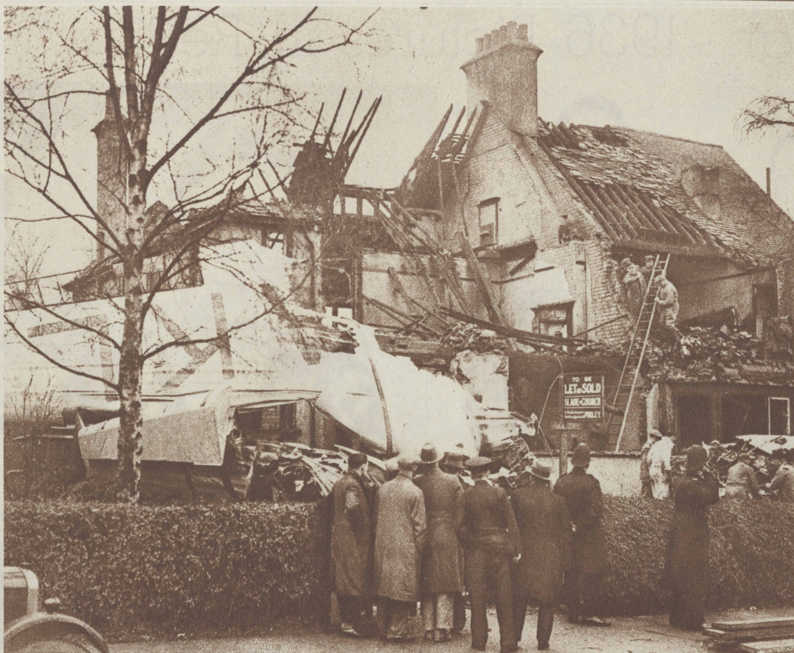
AFTER THE TRAGIC FLAMES—Remnants of the Dutch airliner and the English house into which it crashed. Only three persons aboard the plane survived.