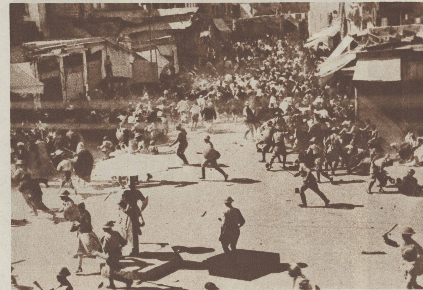
ARABS TWEAK THE TAIL OF THE BRITISH LION, warring on the new Jewish settlements of Palestine. Pictured: British police dispersing a mob at Jaffa.