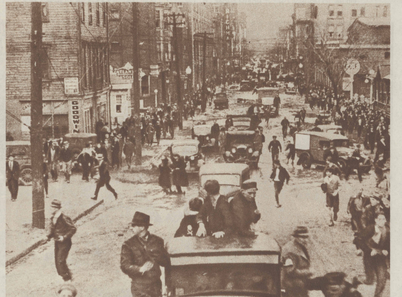
DEATH AND DESTRUCTION rode March floods in eastern states; hundreds were killed, hundreds of thousands made homeless, property valued at hundreds of millions of dollars destroyed. Pictured: Terrified residents of Johnstown, Pa., flee through the streets, after passage of the flood crest, upon a false rumor that the Quemahoning dam had burst.