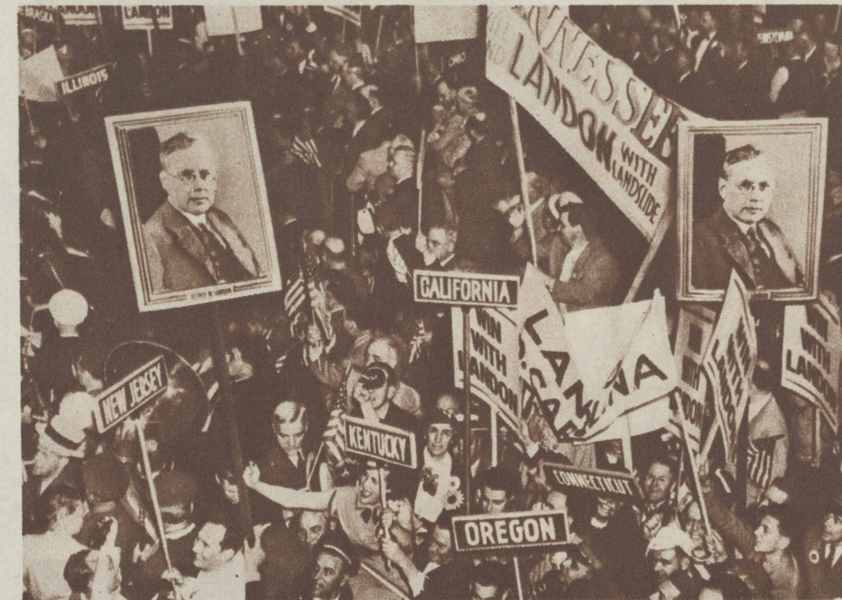
POLITICAL DRAMA enlivened the Republican national convention at Cleveland. When Gov. Alf M. Landon was nominated on the night of June 11 pandemonium ensued.