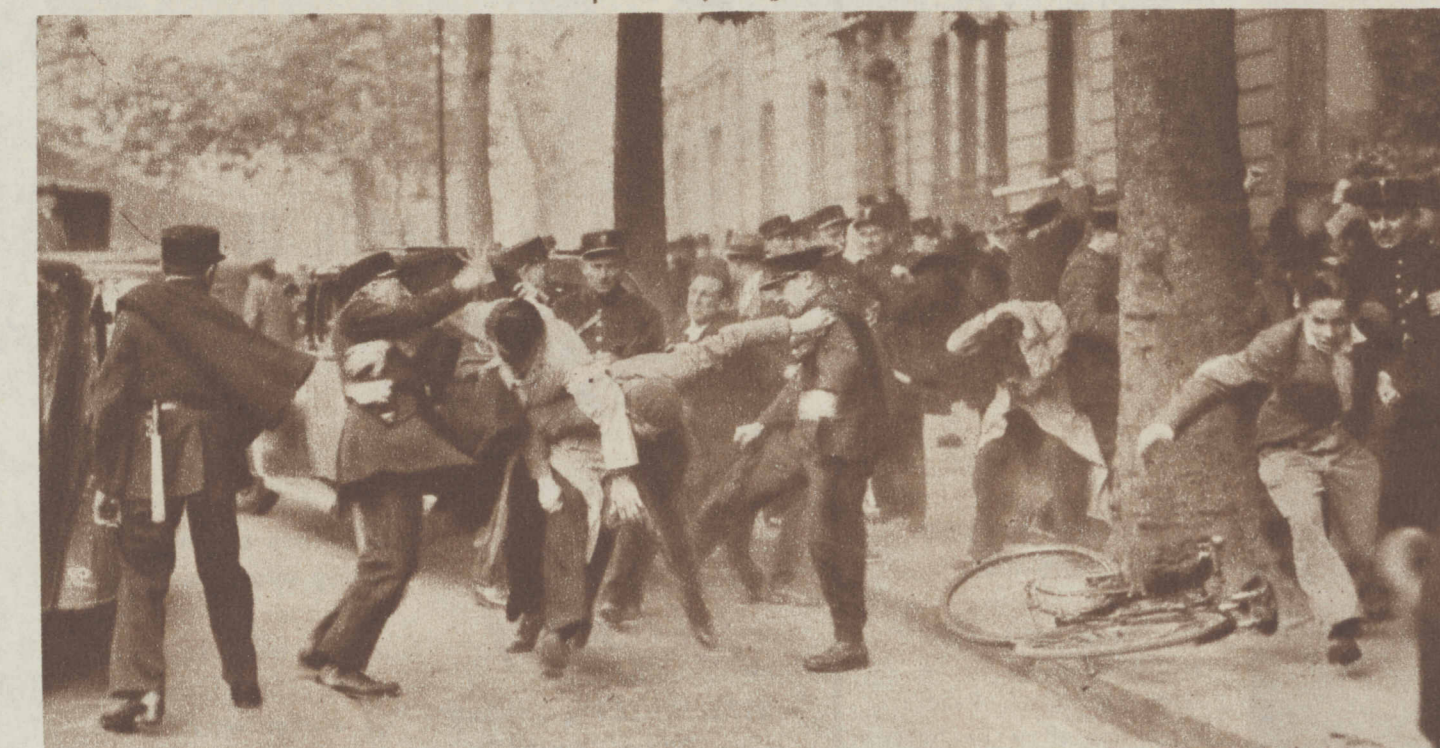
RIGHT AND LEFT WAR IN FRANCE in sporadic riots that momentarily threaten to engulf the nation in civil strife. Pictured: Demonstrating Fascists battle Paris gendarmes.