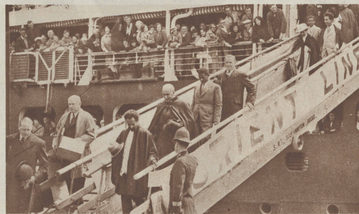
ITALY WINS ITS WAR IN ETHIOPIA, Fascist troops entering the capital, Addis Ababa, on May 4, and Emperor Haile Selassie flees into exile. Pictured: The emperor arriving with his entourage at Southampton, England.