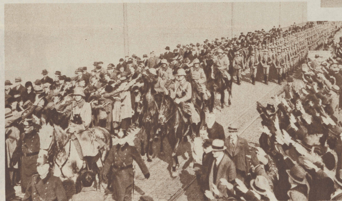
HITLER MAKES MORE SCRAPS OF PAPER OUT OF THE VERSAILLES TREATY—Among 1936 breaches of the peace was der Fuehrer's Rhineland occupation coup. On March 7 an army 50,000 strong began marching into the demilitarized area. Pictured: Germans at Mainz cheer troops crossing the Rhine.