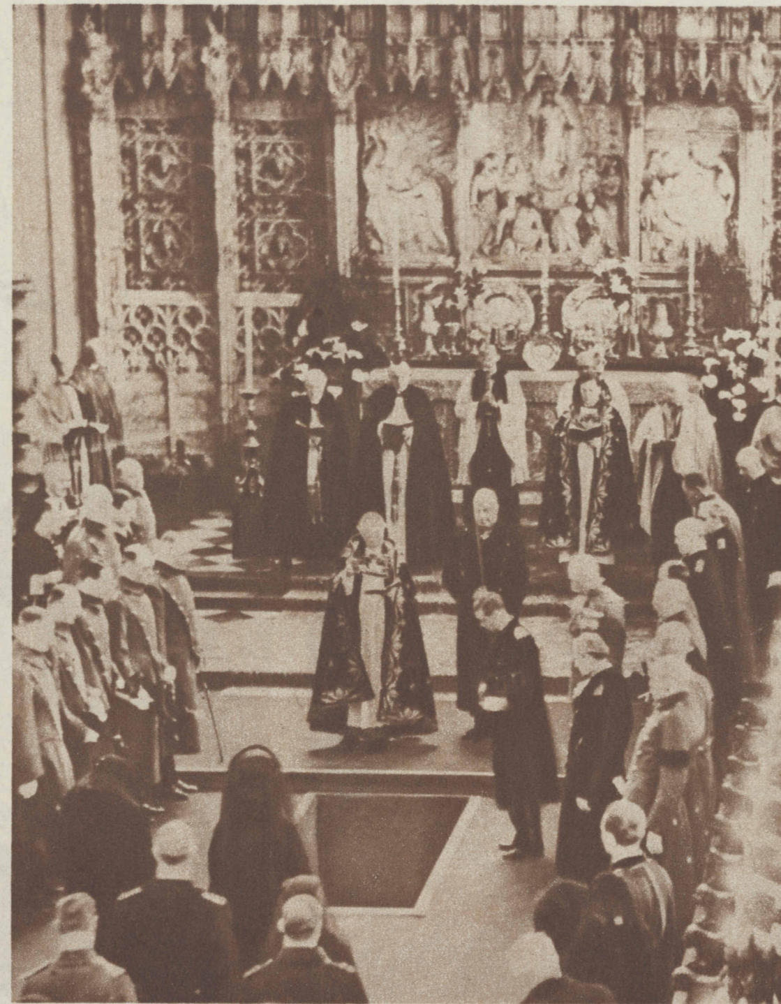
AN ENGLISH KING DIES—Edward VIII, sprinkling earth on the casket containing the remains of his father just before it is lowered into vaults at St. George's chapel, Windsor castle. The death date of George V.: Jan. 20.