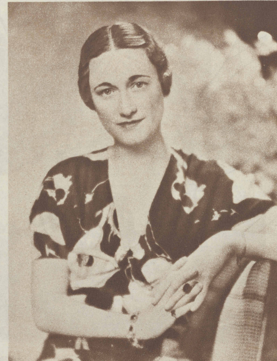
THE WOMAN for whom Edward VIII, renounced the throne: Mrs. Simpson.