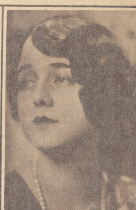
MISS M— Oak Park, Ill.—Stenographer