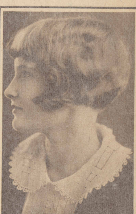
MISS B— East 65th Street, Chicago—Student

PICKING PEACHES IS HARD WORK, say the judges who are looking for the prettiest Peaches of the central west in The Tribune's great $20,000 search. But they will finish their task as soon as possible. In the meantime watch this section every Sunday for new pictures of the candidates whose beauty makes it so hard for the judges to select the fairest of the fair.