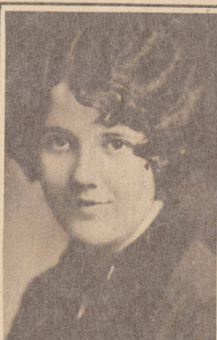
MISS A— Shawano, Wis.—Home Girl