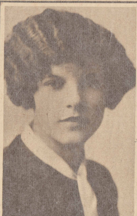
MISS R— Council Bluffs, Ia.—Stenographer