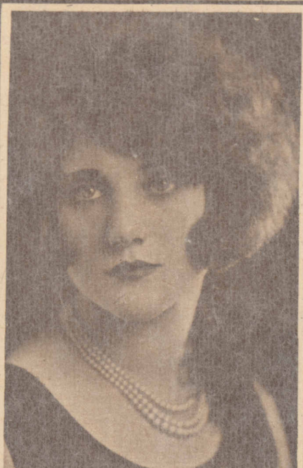
MISS B— Columbia City, Ind.—Home Girl