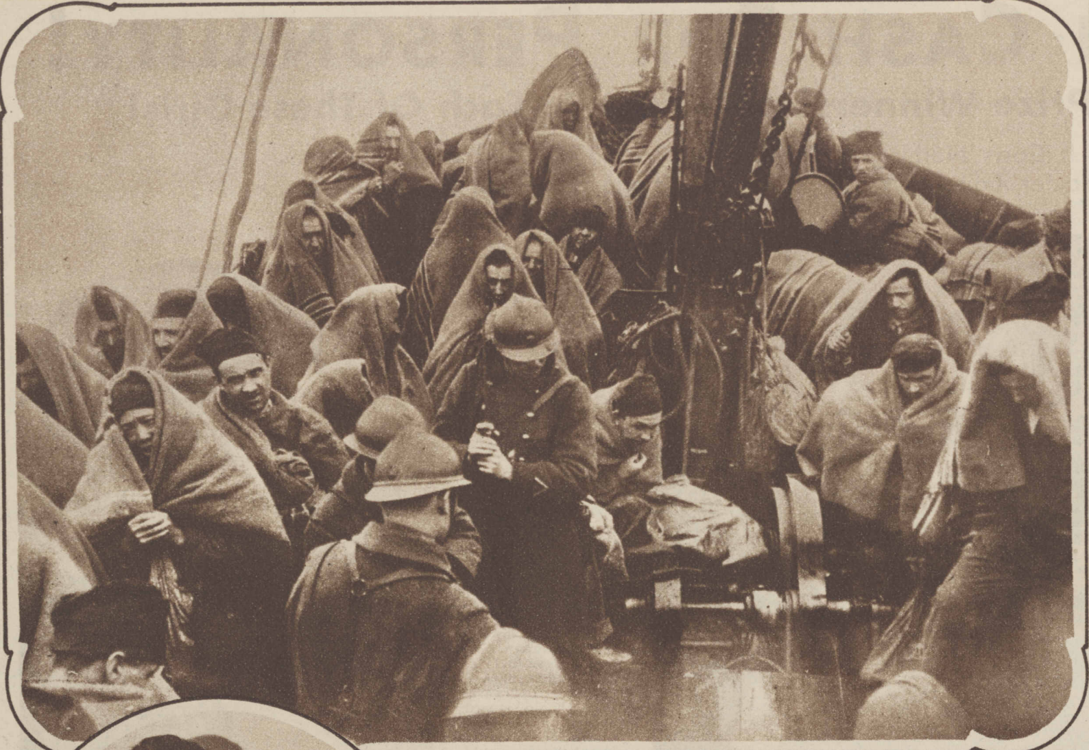
OFF TO A LIVING DEATH —Their faces a picture of horror, French prisoners boarded a tug bound for the dreaded convict ship, La Martiniere. The group was a part of 673 men taken to Devil's island, there to enter a life from which there is no escape.