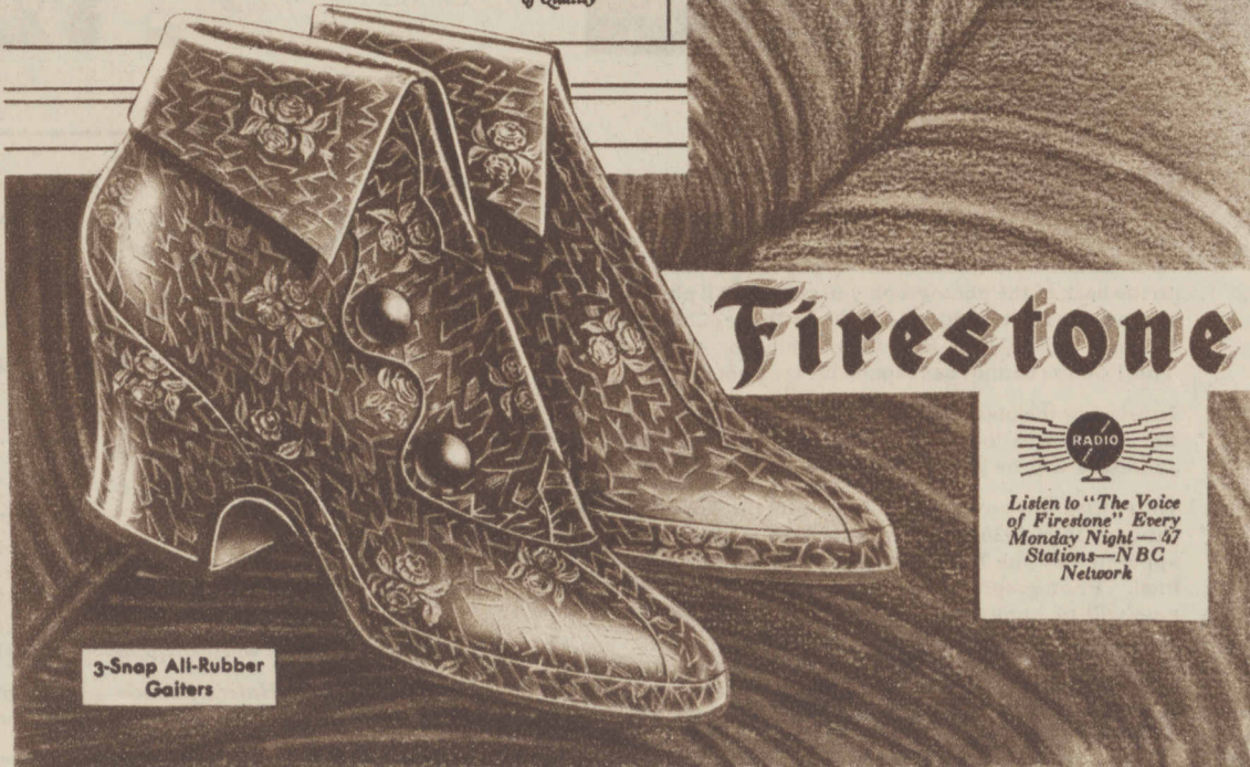
3-Snap All-Rubber Gaiters