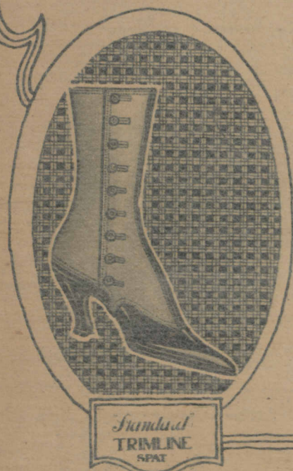
Standard TRIMLINE SPAT

The largest and foremost manufacturers of Spats in the World