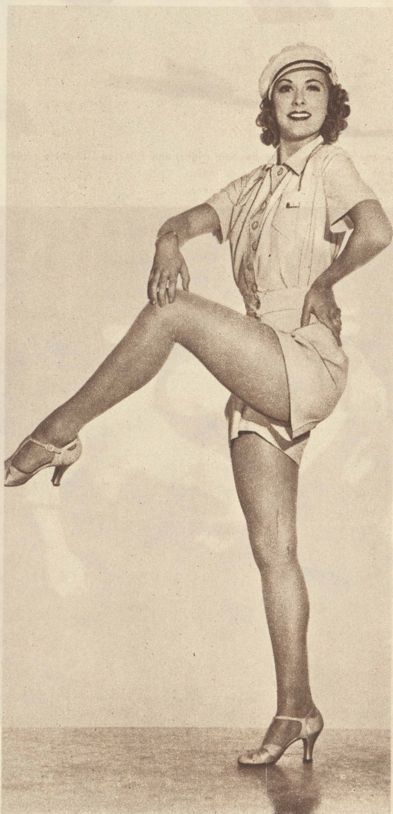
QUEEN OF TAPS—A new action snapshot of Eleanor Powell.