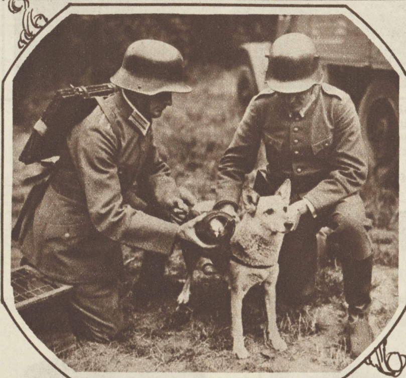
CARRYING A CARRIER PIGEON —Two German soldiers in a field maneuver demonstrate how the pigeons' cages are attached to the saddle when dogs are pressed into service to carry the birds to their starting place.