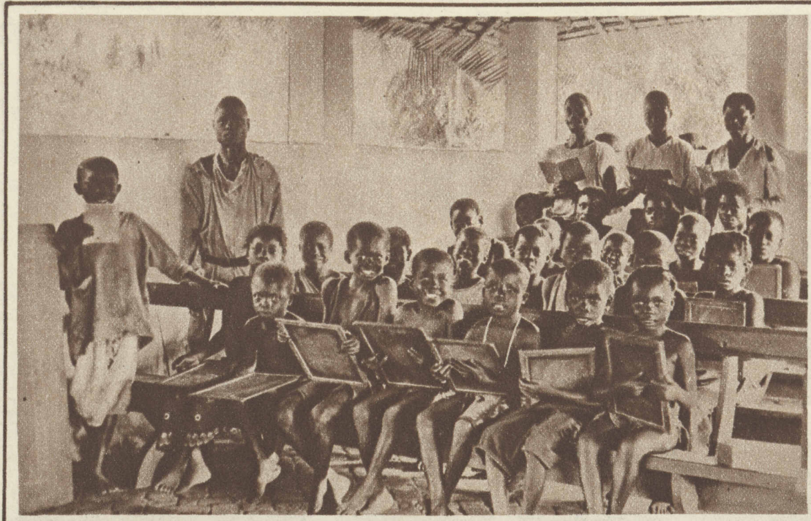
THE LITTLE BLACK SCHOOLHOUSE —With white missionaries as teachers, students in the Belgian Congo, Africa, have no difficulty in matching their slates with their complexions.