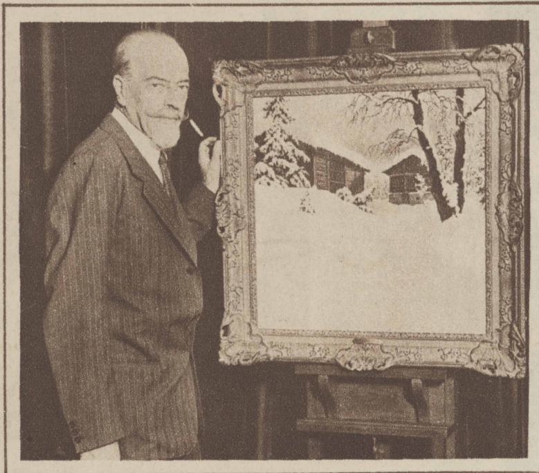
A LECTURING COUSIN OF THE CZAR, Grand Duke Alexander of Russia, opened an exhibition of pictures in New York shortly after his arrival in the states for his newest speaking tour. The grand duke, whose home is in Paris, was a lecturer in Chicago last January.